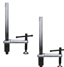
UDN6150 x 2 Inserta Clamp