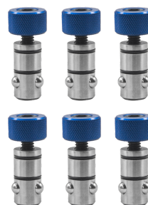
T65055 x 6 Ball Lock Bolts