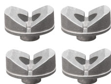
T64216 x 4 V-Blocks