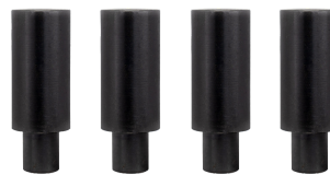
T64205 x 4 Stops