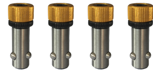
Ball Lock Bolts T65015 x 4