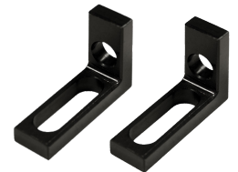
T60304 x 2 Right Angle Brackets