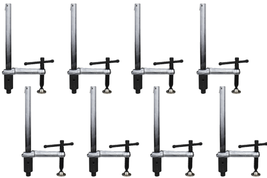
Inserta Clamp UDN6150 x 8