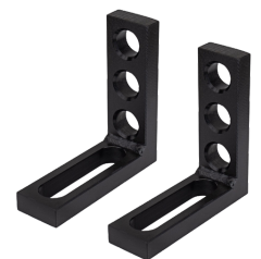
T60305 x 2 Right Angle Brackets