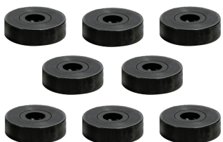
T50737 x 8 Magnetic Rest Buttons