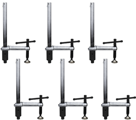
Inserta Clamp UEN6200 x 6