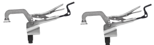
Inserta Plier PT07K x 2

Voor prijs of offerte mail naar, info@dkmtools.nl Telefoon: 0168 357 755