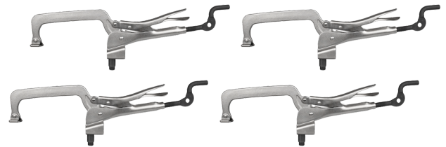
Inserta Plier PT14K x 4